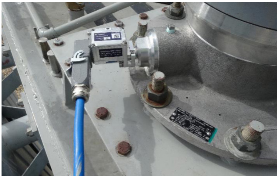
Figure 1: Camlin bushing sensor installed at the bushing test tap to detect both Partial Discharges and changes in Capacitance and Power Factor.

Due to poor manufacturing, metallic particles were trapped in the bushing and free to move when, at higher temperature, the oil viscosity was higher. This was generating Partial Discharges and increase of bushing losses, thus resulting in a Power Factor increase.